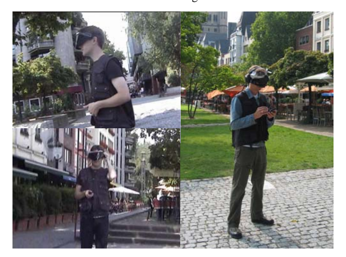
Figure 5. User playing the TimeWarp game in the city of Cologne

While GPS provides approximate information on user position, usually within a few meters, this is not sufficient in situations where users must interact with objects or wants to observe items at a particular location. Tracking problems also resulted in people altering their game playing behavior, either as interaction was difficult or they knew that they would experience problems at certain locations. The GPS tracking issues combined with the