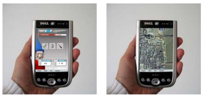
Figure 3Information device with the overall information page (above) and the interaction map (below)

Each player is equipped with two systems: a mobile AR system which augments the real environment, and a handheld-based information device. This information system uses a Dell Axim x51v running Windows Mobile 2005. The device communicates with the AR system via a Bluetooth connection. It provides several services supporting the player during the game (see Figure 3): on an overall information page the game state is provided including the currently owned tools, the current budget and the time left to finish the game. An interactive map showing the current position of the player in satellite or map mode (similar to services such as Google maps) allows for easy player guidance within the city. The player may navigate and zoom in or out. Additionally, depending on the current game state, important game related locations are represented within the map. Moreover, specific information such as historical knowledge of the city or technical help is provided to the user by this application.