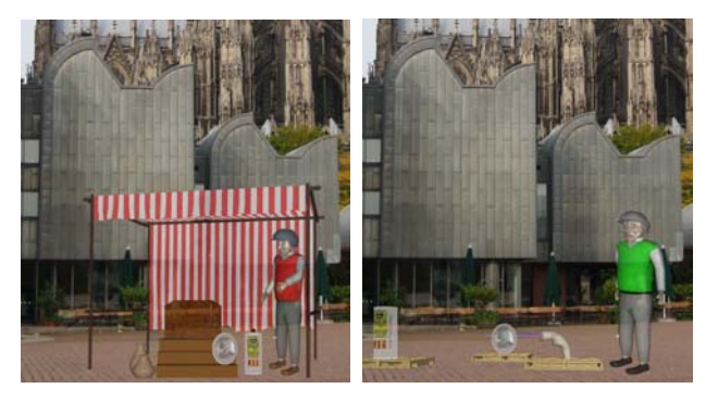
Figure 4. A market place displayed in different time periods (medieval – left, roman – right)

place in different time periods allows witnessing its change over time; the game concept of time travel through time portals instead of a timeline-based widget control for selecting the current time period additionally contributes to this experience. Furthermore temporal changes and augmentations are reflected across the range of devices. An example of temporal change is a piece of