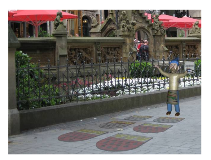
Figure 2. Sample challenge: identifying the correct coat of arms

The game is staged in the old part of Cologne, within an area of about 1.5 square miles. As the players walk around they have to locate game relevant locations so that they can interact with the various elements. Three different types of game locations are implemented: time portals (leading to other time periods), markets (to buy items that are required to solve challenges), and the challenges itself. The main virtual characters in the game are the Heinzelmännchen, but other characters support the feeling of being in different time periods. In addition to graphical augmentation TimeWarp features spatial sound. The purpose of sound is firstly to support the sense of temporal presence, and secondly to guide the user through the non-linear game play.